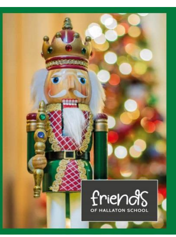
We need 8 more volunteers to help at the Christmas Fair. If you could spare an hour to help with crafts & games, serving drinks or selling raffle tickets, please speak to a teacher or a Friends Member.